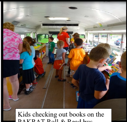
Kids checking out books on the PAKRAT Roll & Read bus.