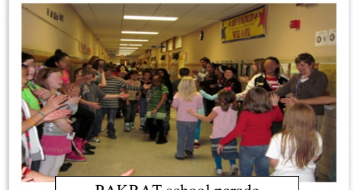
PAKRAT school parade