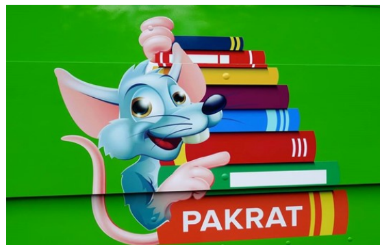
PAKRAT: P-3 Child literacy and parent involvement program